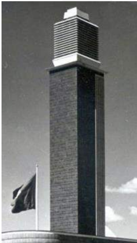
The Belgian Pavilion, Tower New York, NY World's Fair 1939