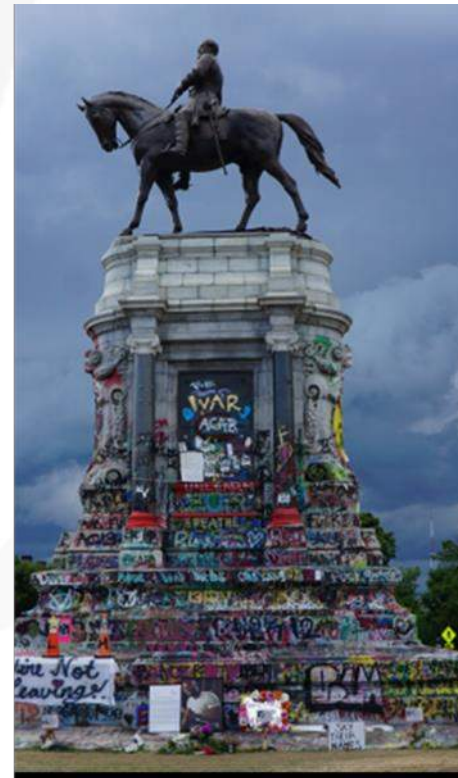
Robert E. Lee Monument Jean-Antoine Mercié, Sculptor Lee Circle, Monument Avenue July 22, 2020