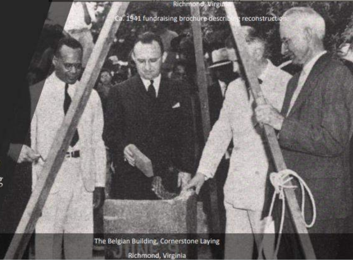
The Belgian Building, Cornerstone Laying

Ca. 1941 fundraising brochure describing reconstruction.