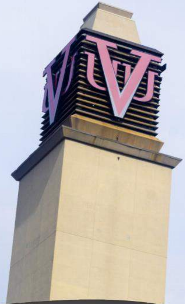
The Belgian Pavilion Undated photograph, probably 1939 Photograph depicts Belgian Building at New York World's Fair