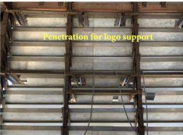
Penetration for logo support