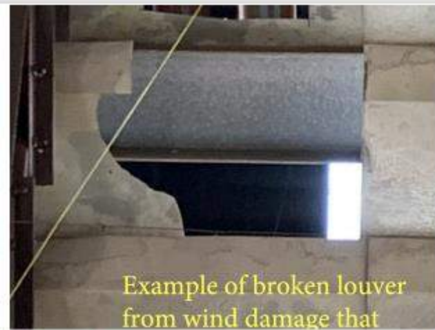
Example of broken louver from wind damage that