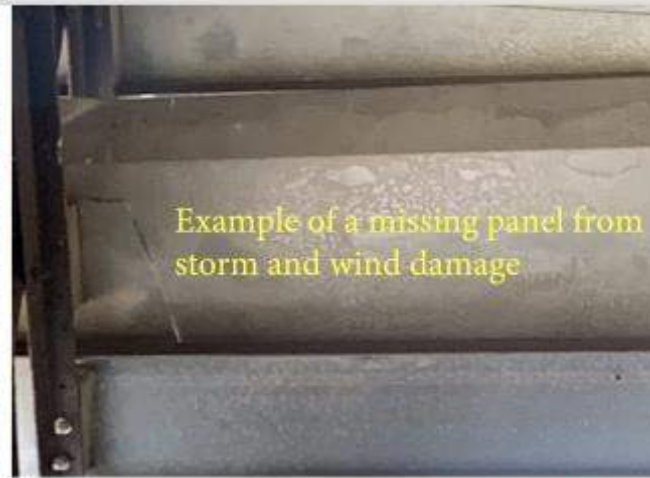
Example of a missing panel from storm and wind damage