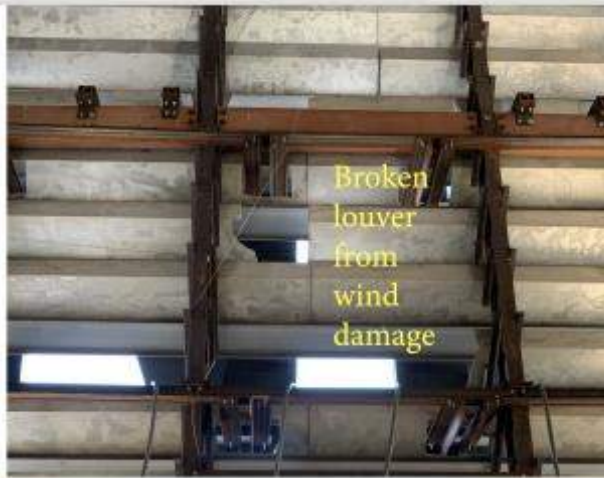
Broken louver from wind damage