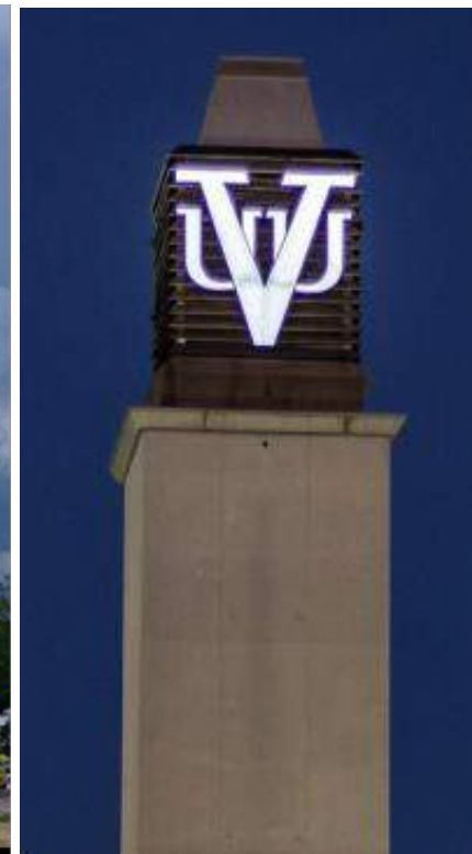
Robert L. Vann Memorial Tower Belgian Friendship Building Future of RVA