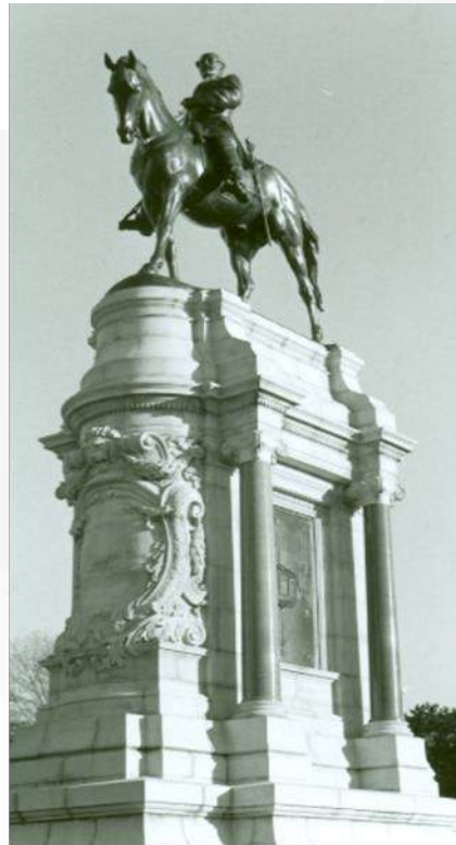
Robert E. Lee Monument Marius Jean Antonin Mercié Lee Circle, Monument Avenue (May 29, 1890)