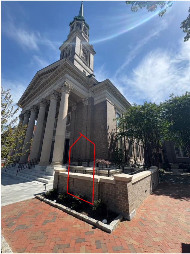
Figure 1. View of the recently constructed ramp and retaining wall in front of St. James Church. The new sign will be incorporated into this wall.