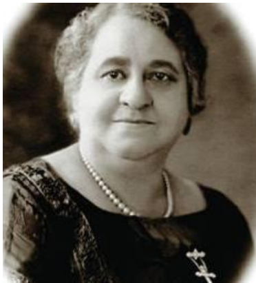
Maggie Walker Initiative