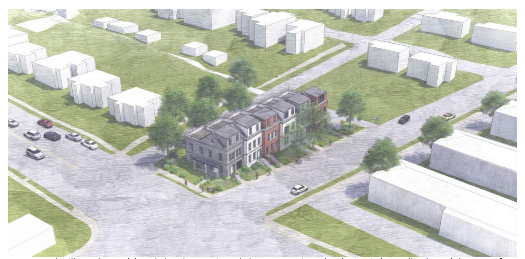
Representative illustrative models and elevations are intended to convey orientation, basic window-wall ratio, and character of proposed units while allowing for flexibility in detail and configuration of rooflines and porches/stoops or as otherwise approved at the time of building permit. Siding materials outlined in detail in Applicant's Report