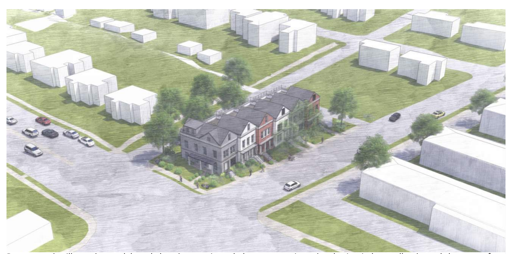
Representative illustrative models and elevations are intended to convey orientation, basic window-wall ratio, and character of proposed units while allowing for flexibility in detail and configuration of rooflines and porches/stoops or as otherwise approved at the time of building permit. Siding materials outlined in detail in Applicant's Report