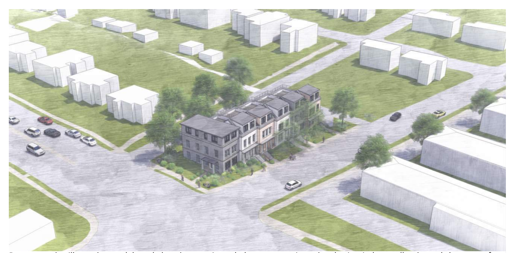
Representative illustrative models and elevations are intended to convey orientation, basic window-wall ratio, and character of proposed units while allowing for flexibility in detail and configuration of rooflines and porches/stoops or as otherwise approved at the time of building permit. Siding materials outlined in detail in Applicant's Report