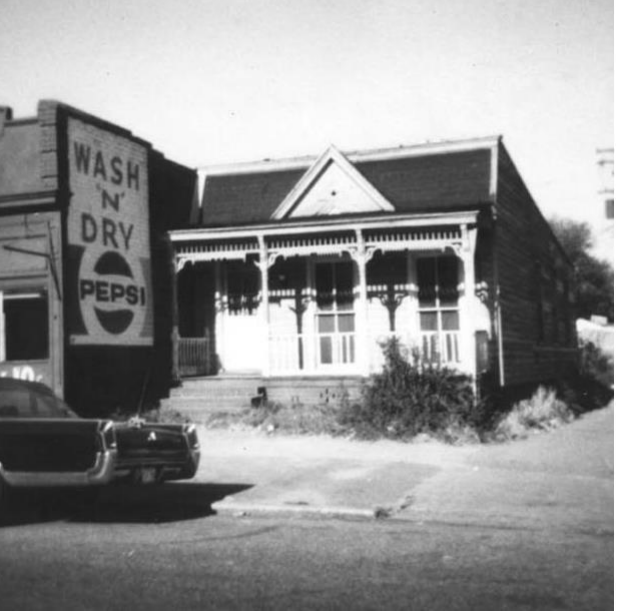
Figure 6. Historic photo of 3308 E. Marshall (now demolished)