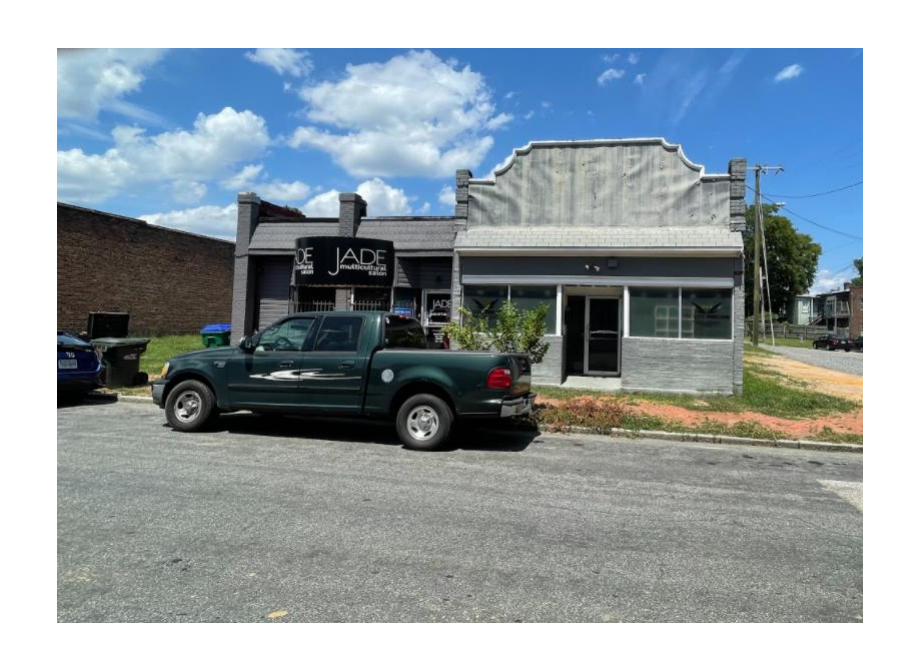
Figure 2. Current E. Marshall elevation showing 3304 and 3306 E. Marshall facades.