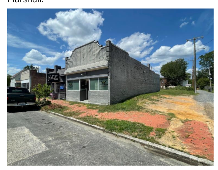
Figure 7. View of facades facing west