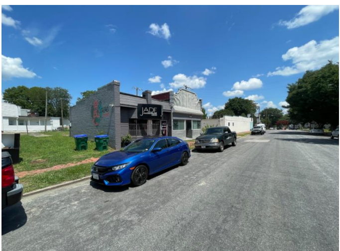
Figure 8. View of facades facing east