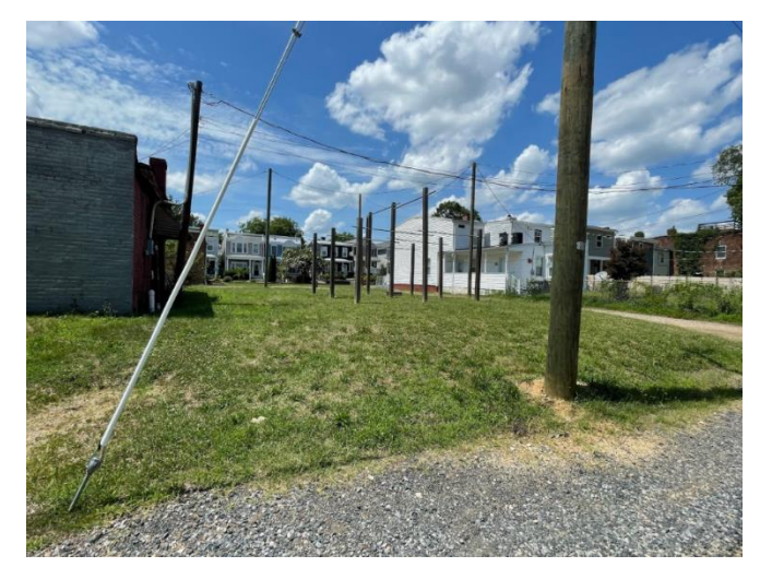
Figure 10. View of rear of buildings facing 33^{\rm rd} Street