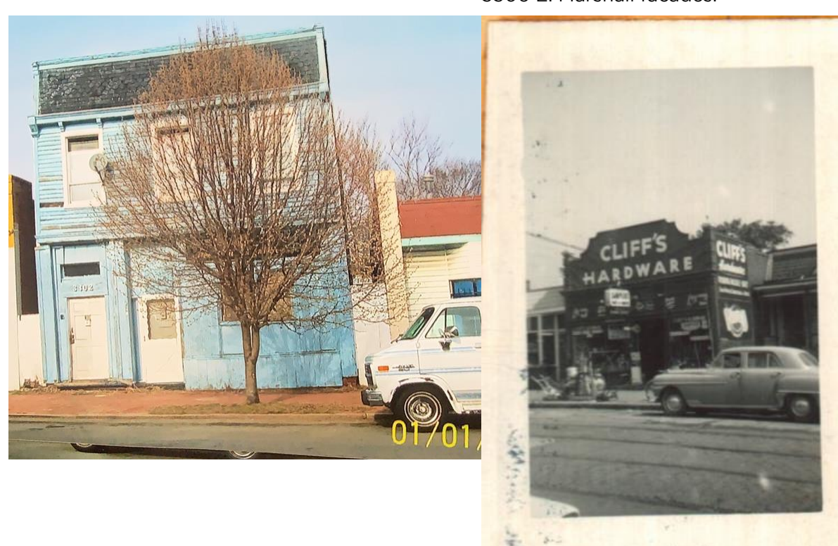
Figure 3. 2003 photo of 3302 E. Marshall St. (now demolished)