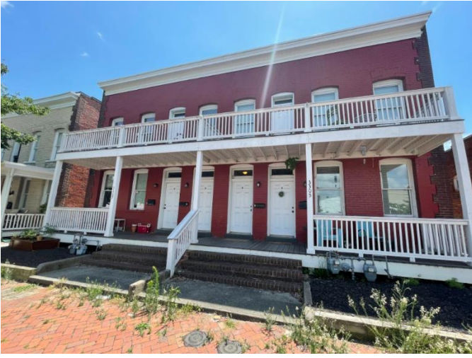
Figure 11. View of apartments across the street