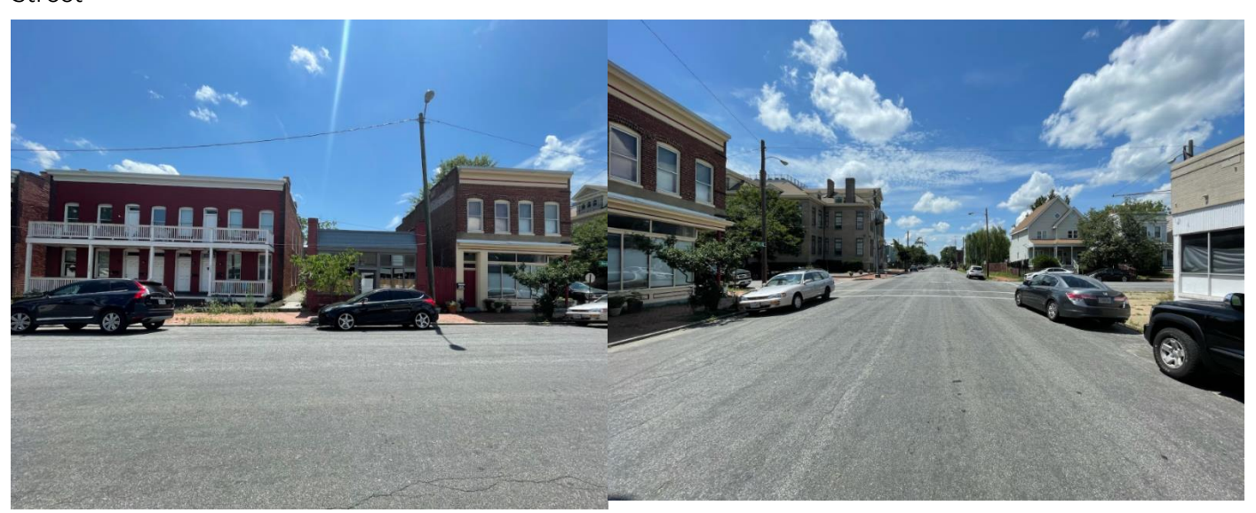
Figure 12. View from across the street