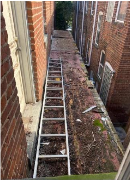
Figure 3. Existing conditions of porch on 2 nd story.