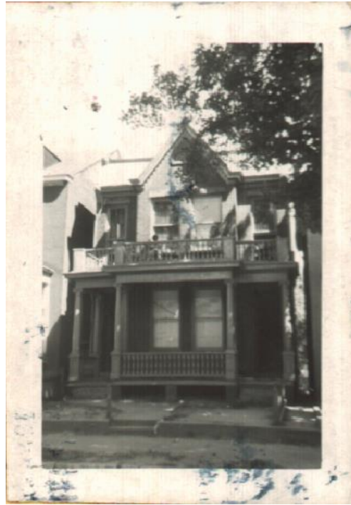
Figure 2. Historic photo from Assessor's office