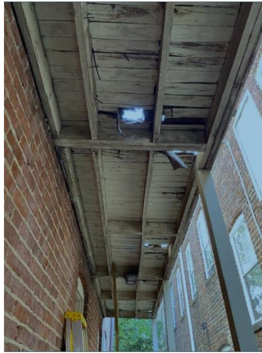
Figure 4. View from under existing deteriorated porch.