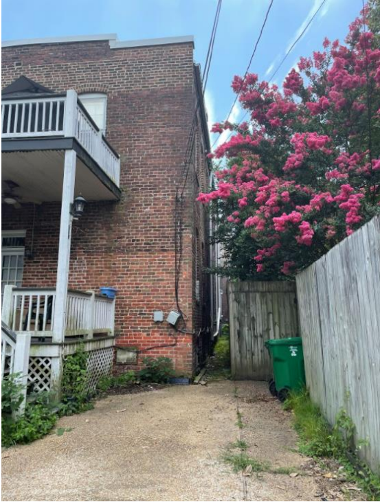
Figure 5. View of the rear from the alley.