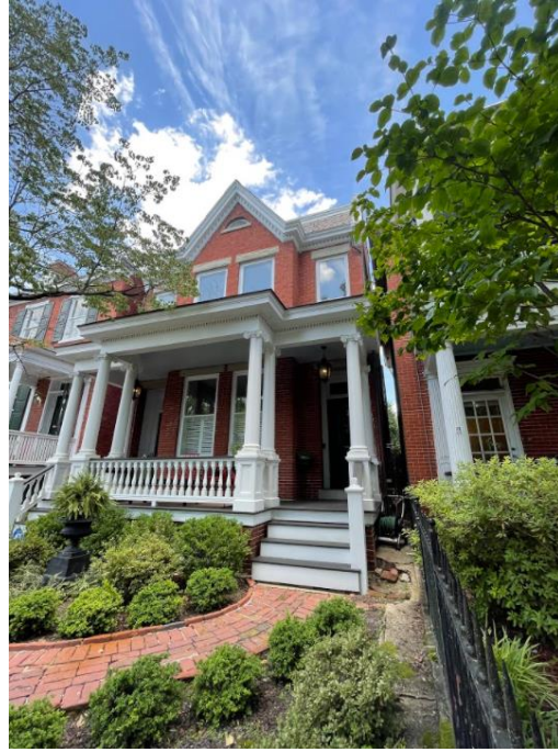
Figure 6. Photo of the front façade.