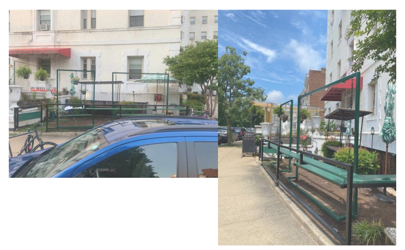
Figure 5. Existing front elevation.