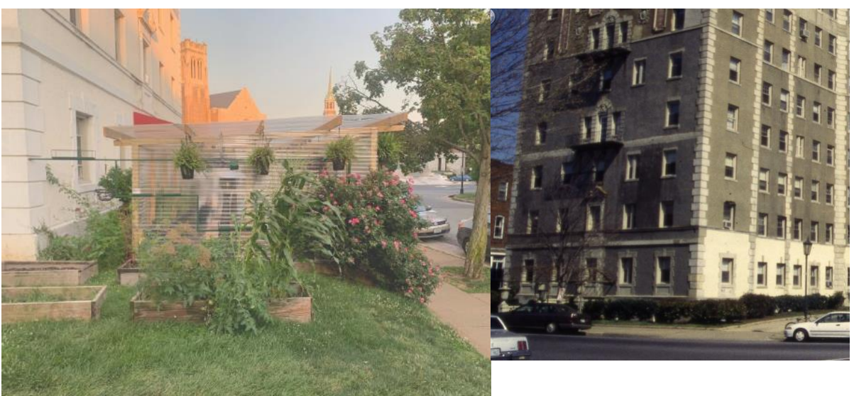
Figure 3. Existing side elevation.