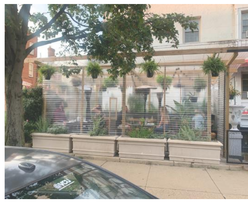
Figure 2. Existing front elevation of patio.