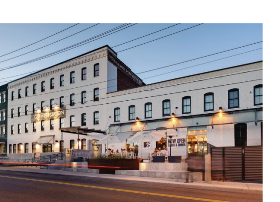
The Lofts at West Station 1

Burchell Pinnock, FAIA | Curriculum Vitae 07/23/2021