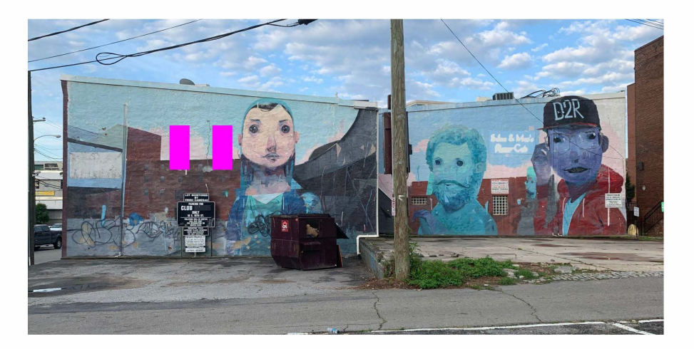
Proposed Windows 2 & 3