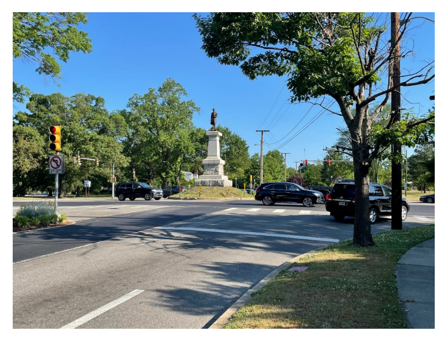
Figure 2. A.P. Hill Monument, current conditions.