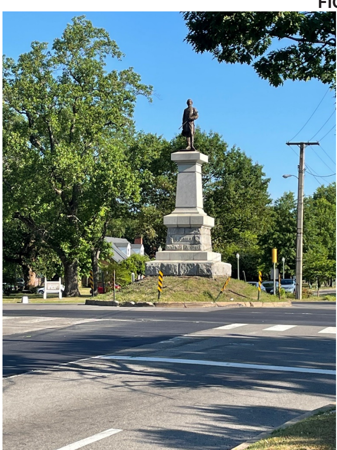
Figure 1. A.P. Hill Monument, current conditions.