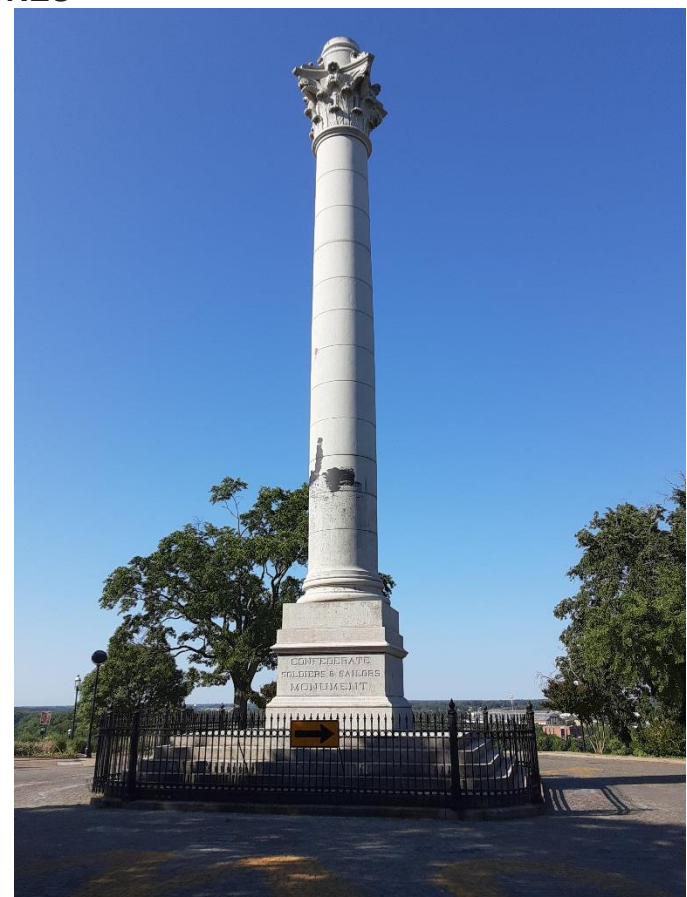
Figure 2. Confederate Soldiers and Sailors Monument, current condition.