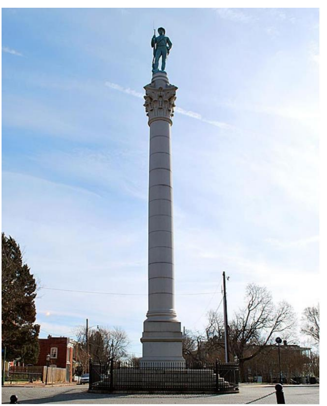
Figure 1. Confederate Soldiers and Sailors Monument, prior to monument removal.