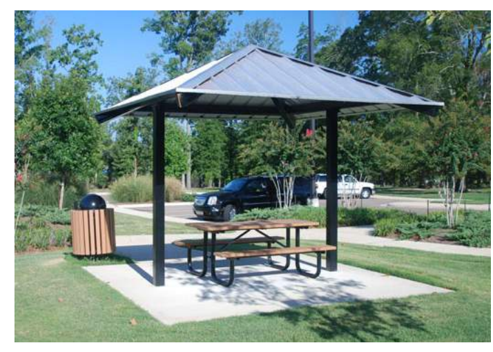
SMALLER PICNIC SHELTER (12. FT. × 12 FT. ) GABLE ROOF SUNSHELTER BY POLIGON. WILL HAVE TWO PICNIC TABLES EACH.