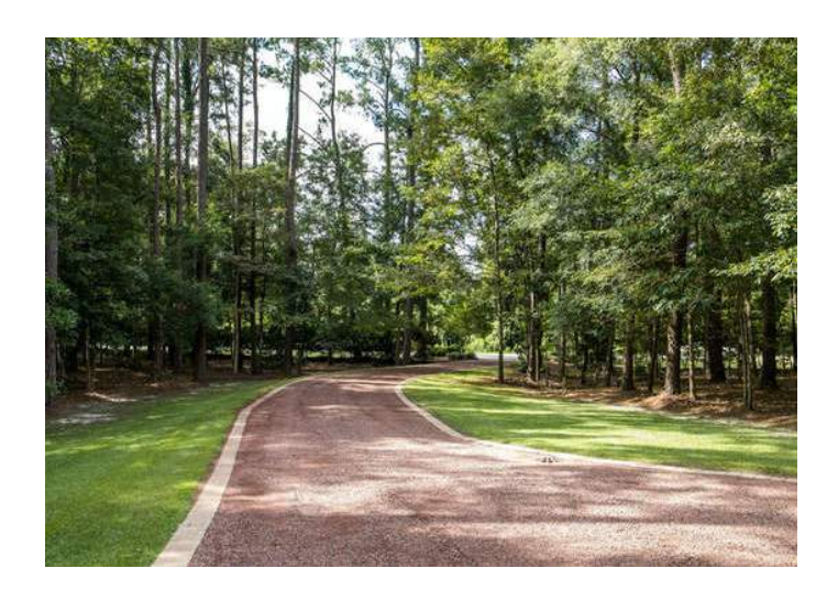
GRAVEL DRIVE WITH TIMBER EDGING