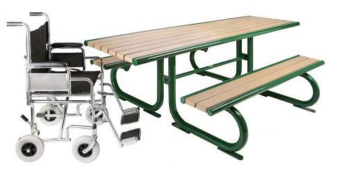
PICNIC TABLE WITH METAL FRAME AND RECYCLED PLASTIC SLATS SHOWN WITH ADA-COMPLIANT CLEARANCE