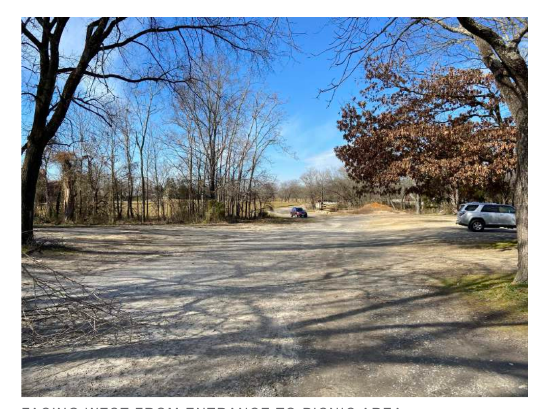
FACING WEST FROM ENTRANCE TO PICNIC AREA