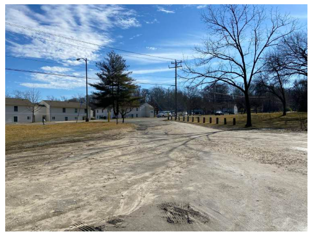
FACING EAST TOWARDS ENTRANCE TO PICNIC AREA