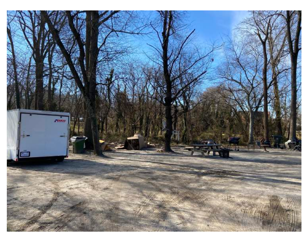
AREA WITH PICNIC TABLES AND TRAILER PARKING