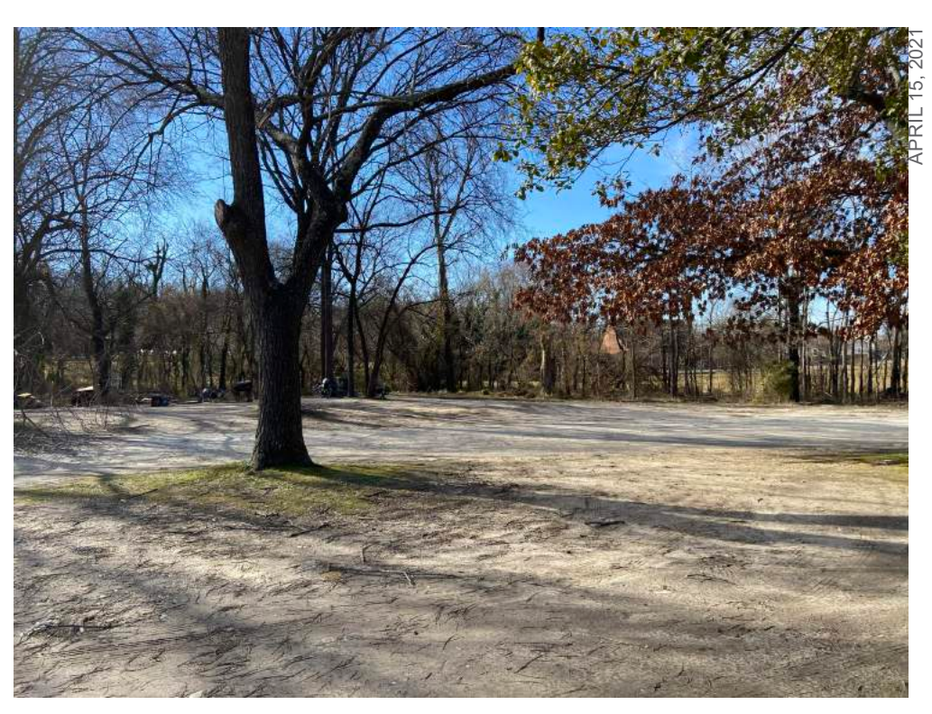
LITTLE TO NO GROUNDCOVER ACROSS ENTIRE AREA