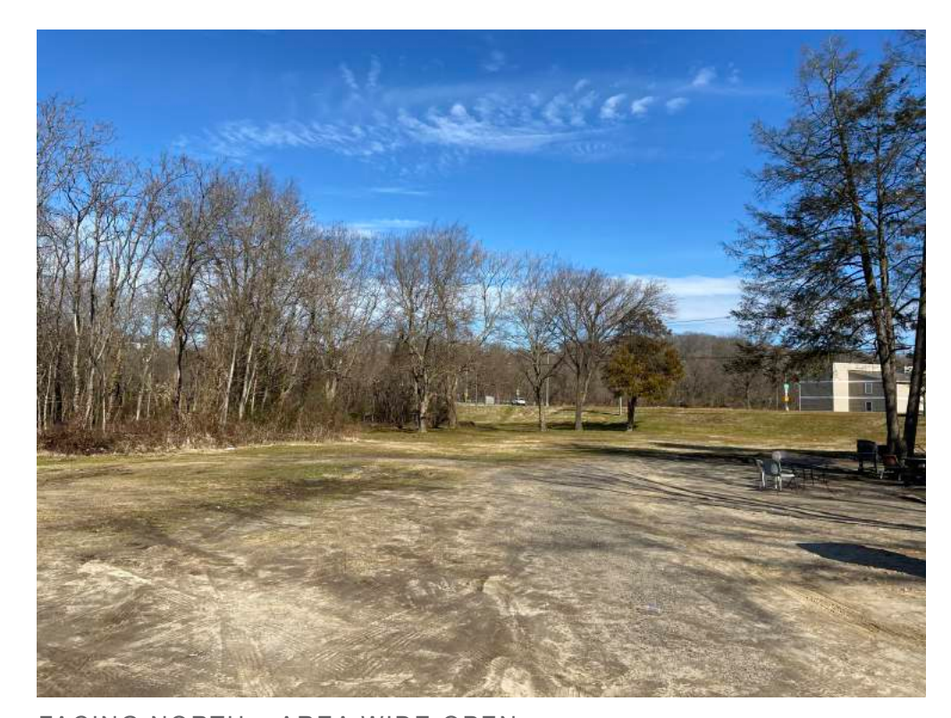
FACING NORTH - AREA WIDE OPEN