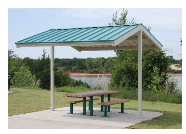
SMALLER PICNIC SHELTER (8. FT. × 9 FT. ) GABLE ROOF SUNSHELTER BY POLIGON WITH ONE PICNIC TABLE