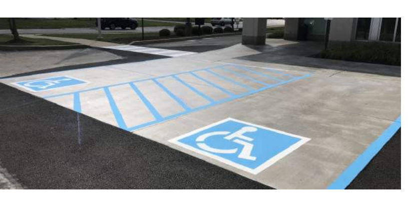
ADA-COMPLIANT CONCRETE PARKING FOR ADA-COMPLIANT SHELTERS AND RESTROOMS