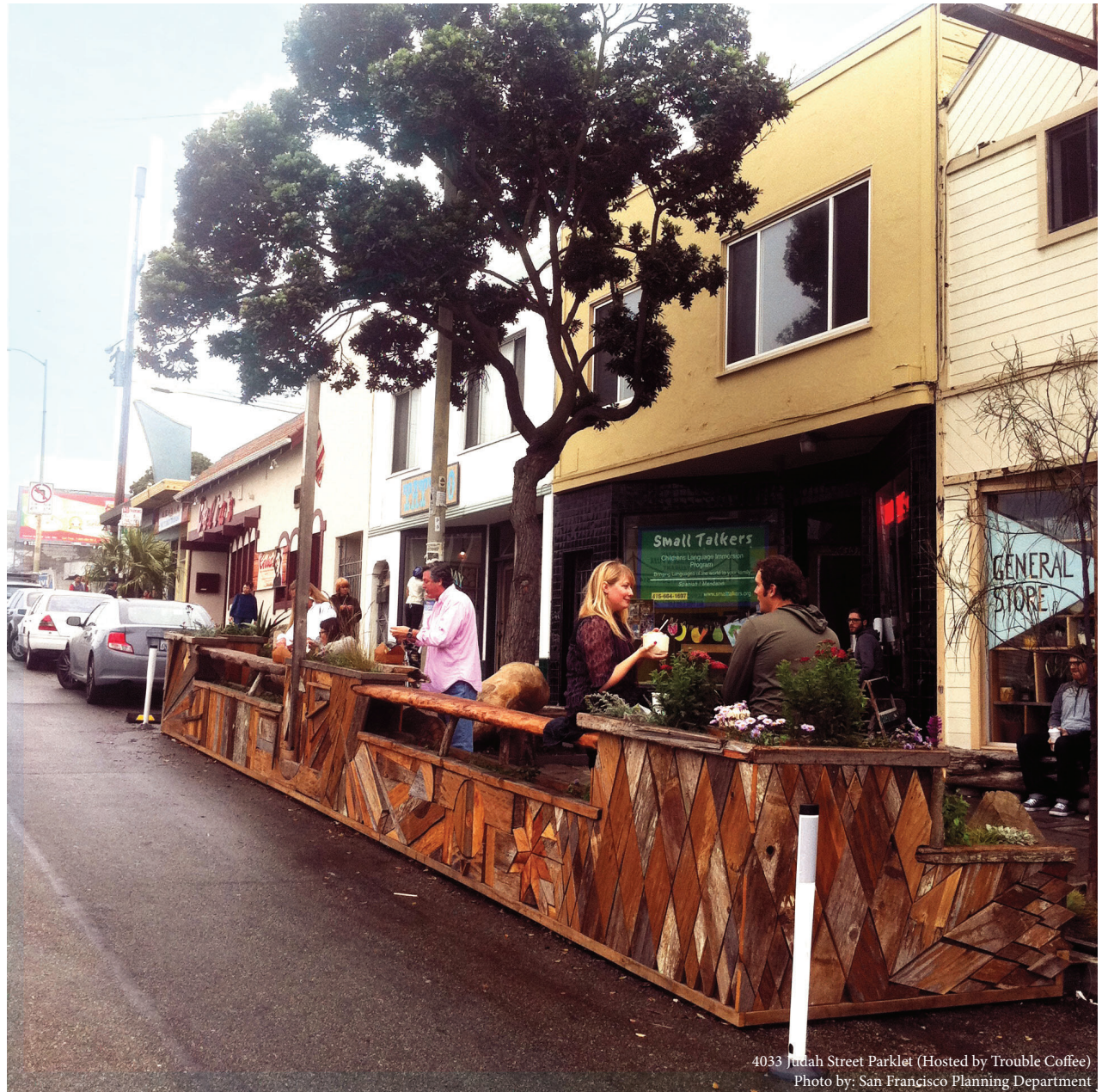
4033 Judah Street Parklet (Hosted by Trouble Coffee)

Parklets must be accessible and safe. All parklet designs must satisfy all of the requirements listed here. Stamped engineering drawings for loading will be required.