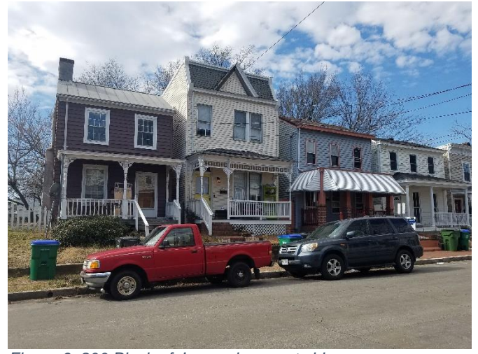
Figure 6. 800 Block of Jessamine, east side.