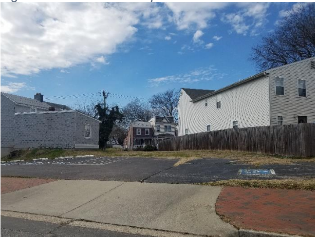
Figure 3. 803 Jessamine Street, view from across the parking lot at the rear.