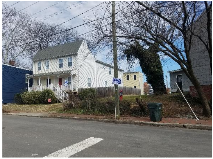
Figure 2. 803 Jessamine Street.