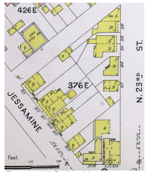
Figure 1. 1925 Sanborn Map.