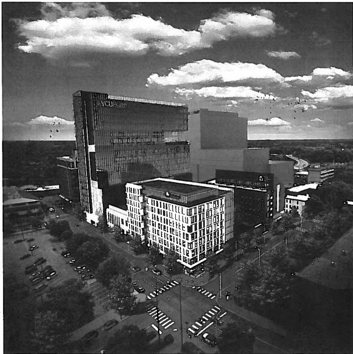
Exhibit C Project Rendering