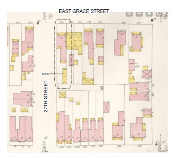
Figure 3. Sanborn Map showing rear outbuilding.