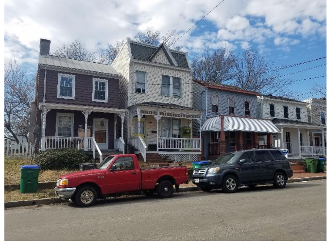
Figure 6. 800 Block of Jessamine, east side.