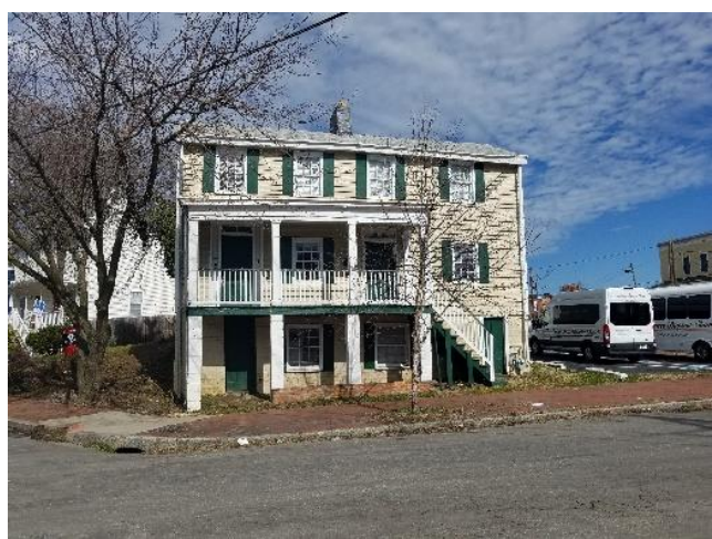
Figure 4. 2228 Cedar Street.