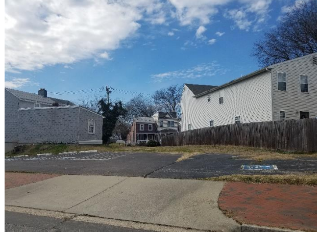
Figure 3. 803 Jessamine Street, view from across the parking lot at the rear.