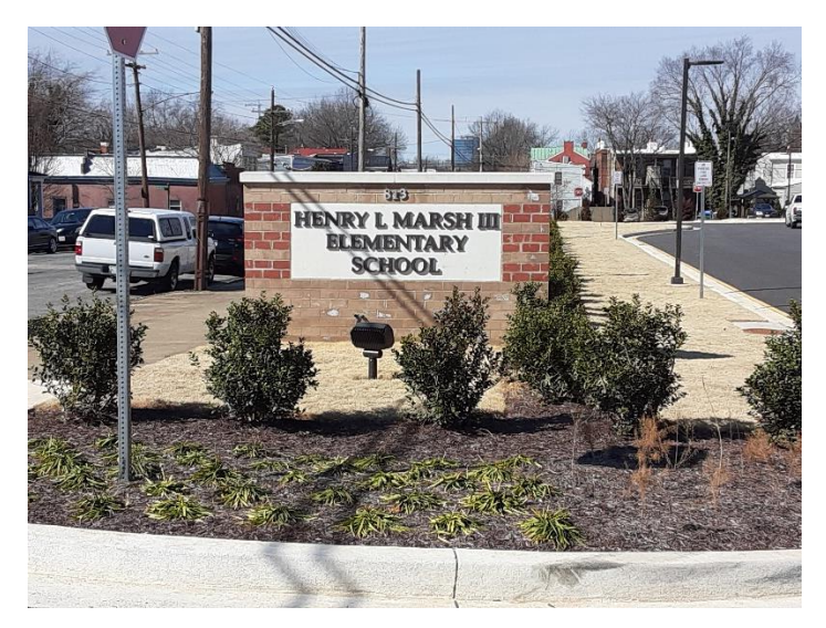
Figure 3. 813 N. 28th Street, existing sign detail.