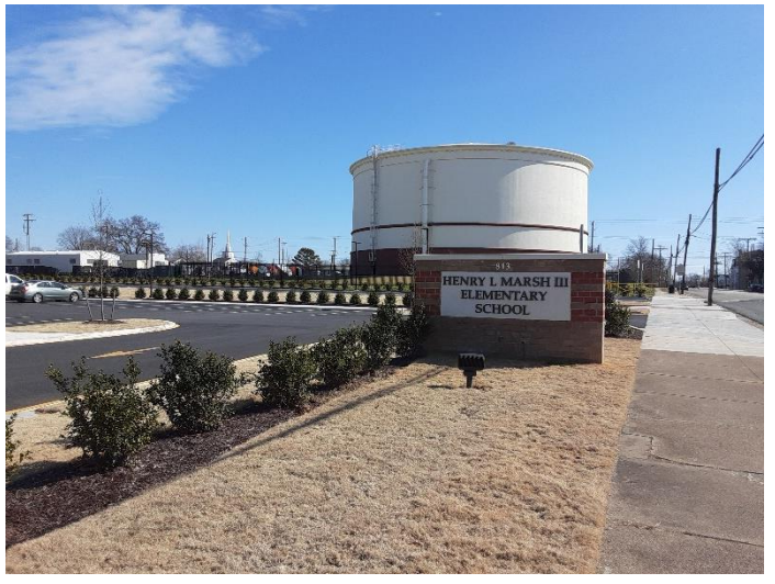
Figure 1. 813 N. 28th Street, existing sign.