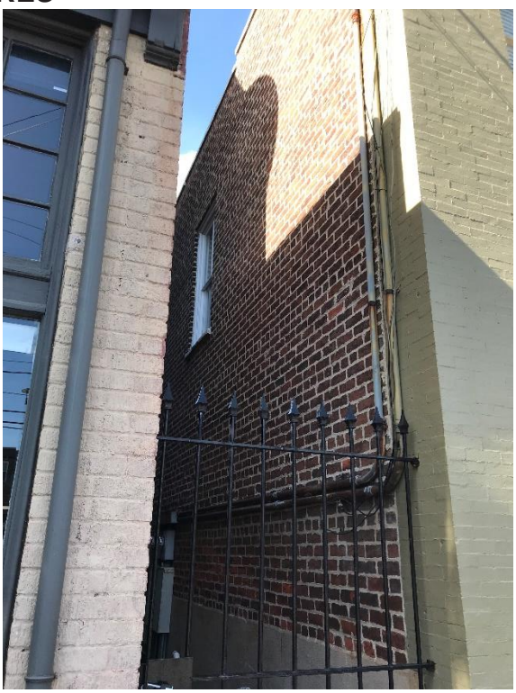
Figure 2. View of side elevation from North 26th Street.