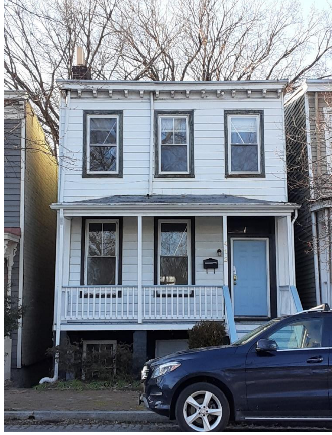
Figure 2. 412 N. 24th Street, facade.