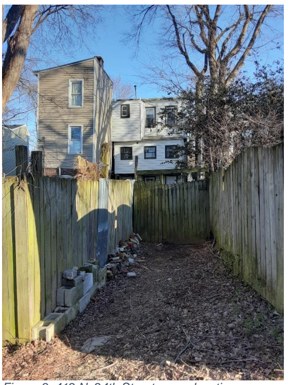
Figure 3. 412 N. 24th Street, rear elevation