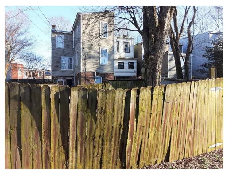
Figure 4. 412 N. 24th Street, rear elevation.