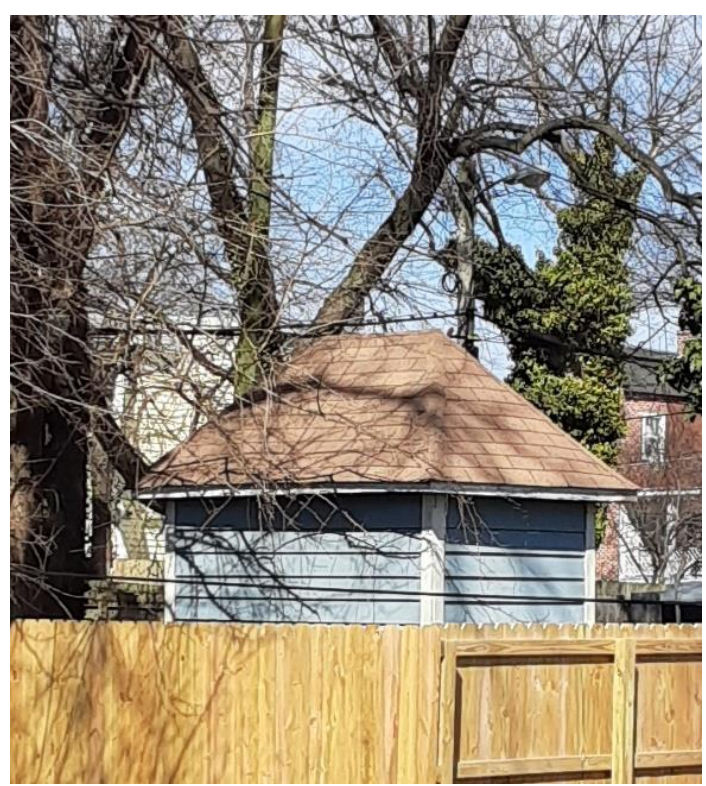
Figure 3. Existing shed on the block.