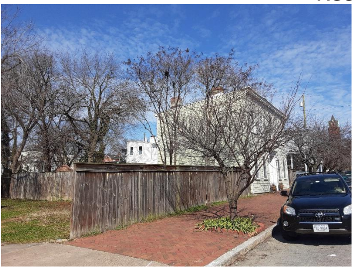
Figure 1. 608 N. 24th Street.