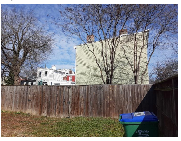
Figure 2. 608 N. 24th Street, rear yard. Proposed location of new shed.