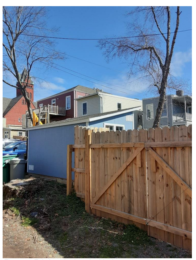
Figure 4. Existing shed on the block.