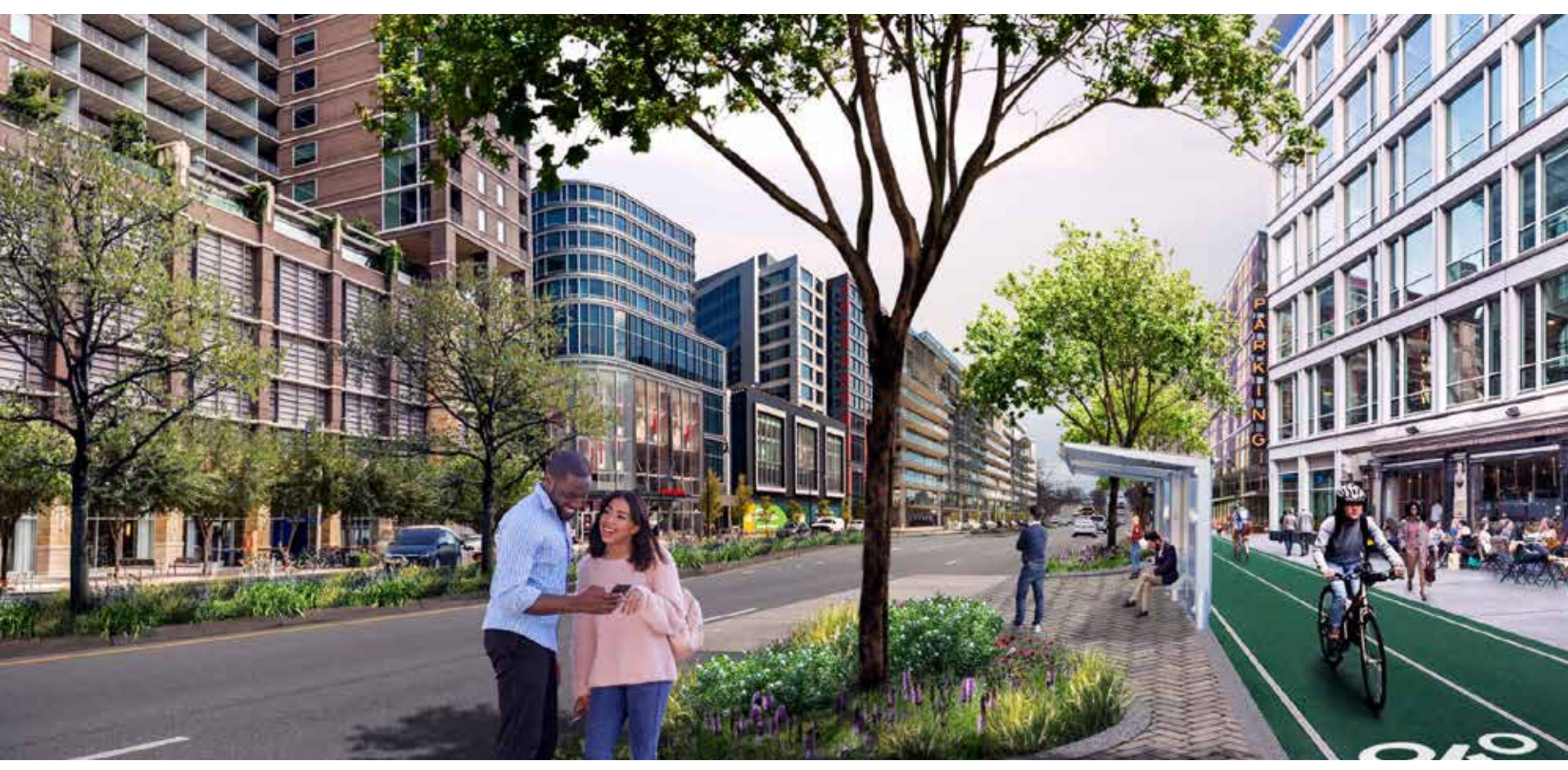
City Planning Commission February 16, 2021