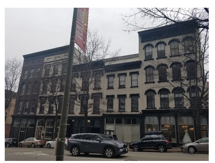
Figure 3. Façade