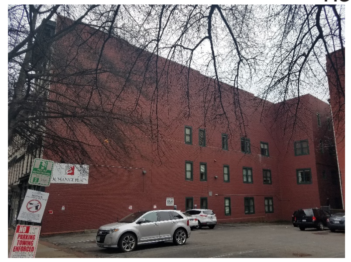
Figure 1. West elevation