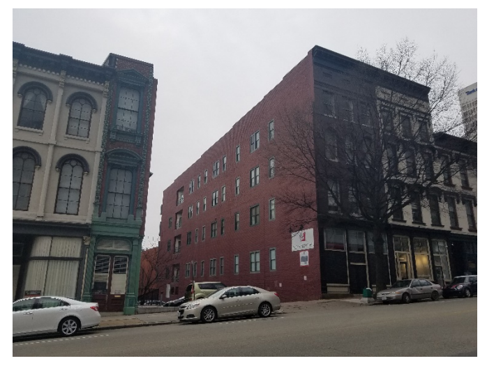
Figure 2. East elevation