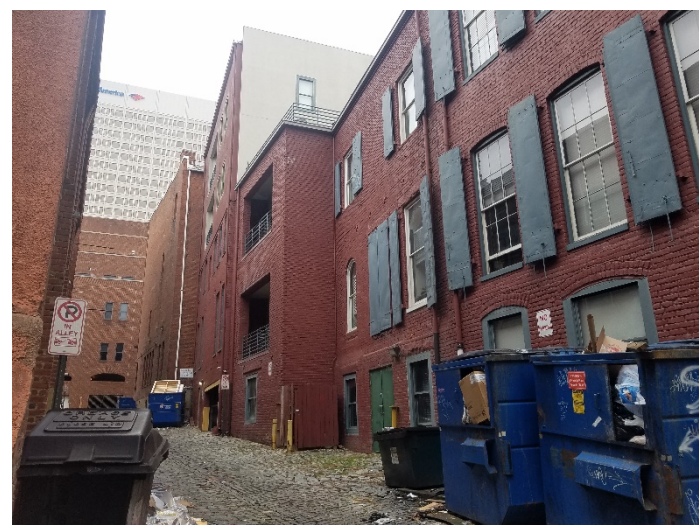
Figure 4. Rear elevation