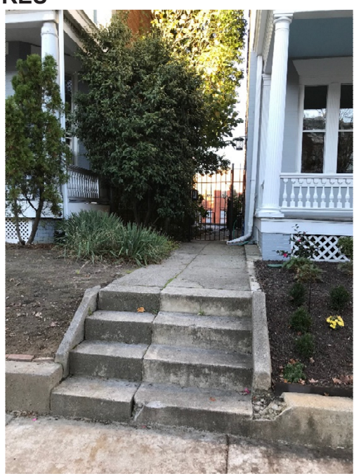
Figure 2. Shared walkway between 2202 and 2204 W. Grace Street.