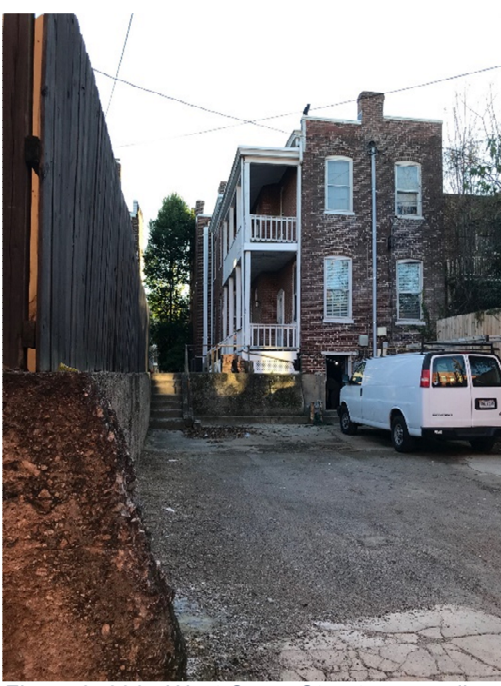
Figure 3. 2204 West Grace Street, rear walk and stairs.