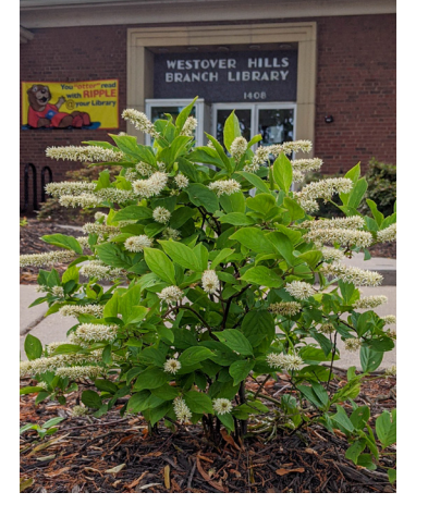
VIRGINIA SWEETSPIRE (ITEA VIRGINICA)