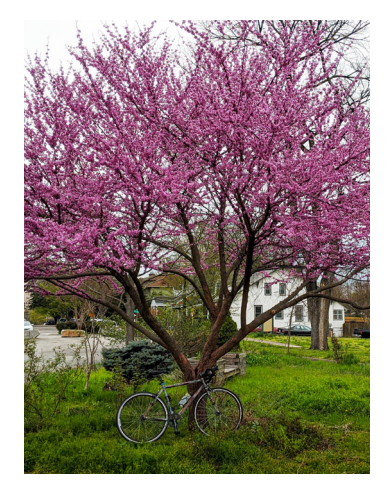
EASTERN REDBUD (CERCIS CANADENSIS)

This rain garden contains native trees, shrubs, and grasses that are naturally found in Richmond. These native plants are adapted to thrive in our area and provide food and habitat for wildlife, such as insects and birds. You can become a River Hero Home by using native plants at home! Learn more at: JamesRiverHero.org