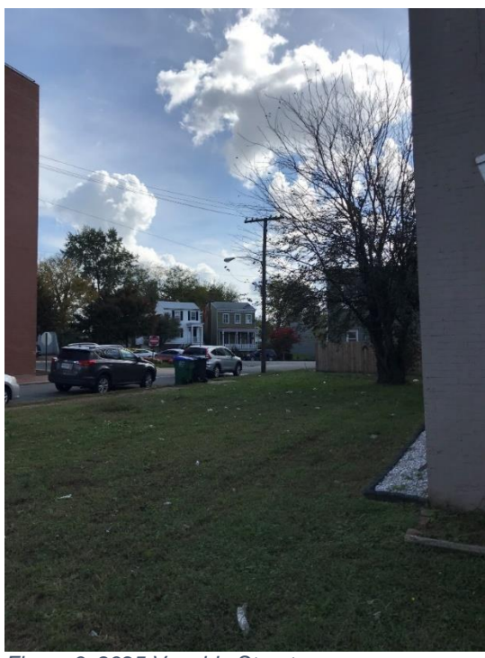
Figure 3. 2325 Venable Street