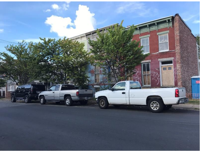
Figure 6. 2300 block Venable Street, even side