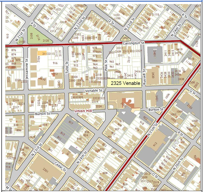
The City of Richmond assumes no liability either for any errors, omissions, or inaccuracies in the information provided regardless of the cause of such or for any decision made, action taken, or action not taken by the user in reliance upon any maps or information provided herein