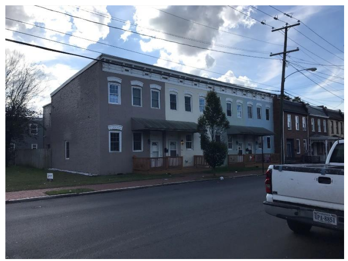
Figure 5. 2300 block Venable Street, odd side west of the subject lot