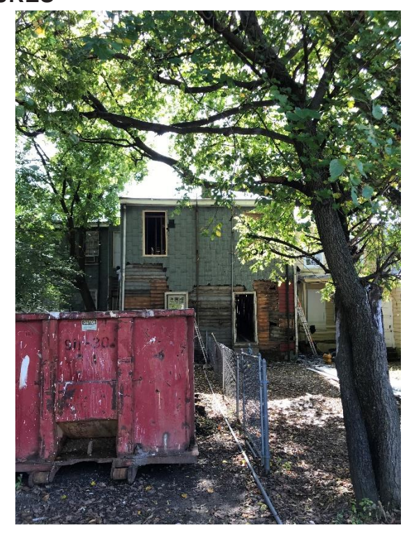
Figure 2. Rear elevation, view from alley