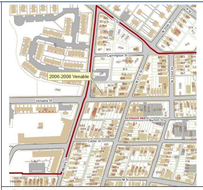
The City of Richmond assumes no liability either for any errors, omissions, or inaccuracies in the information provided regardless of the cause of such or for any decision made, action taken, or action not taken by the user in reliance upon any maps or information provided herein