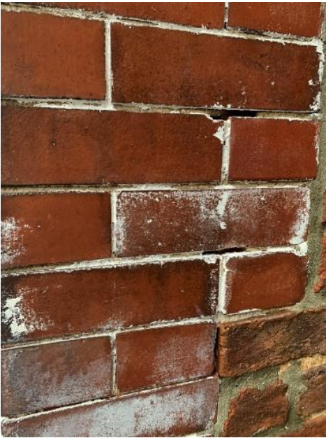
Figure 3. Results of test removal on the masonry.