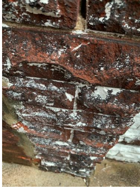
Figure 4. Results of test removal on rusticated masonry.