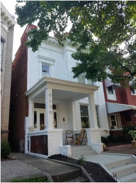
Figure 1. Primed façade of 2306 West Grace Street.