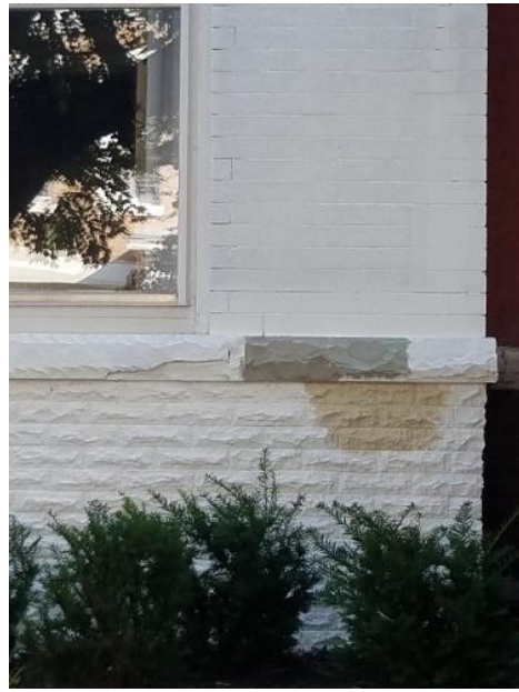
Figure 2. Proposed color swatches on the façade.