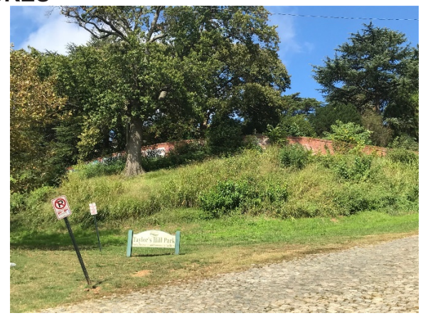
Figure 2. View from 23rd and E. Franklin Streets