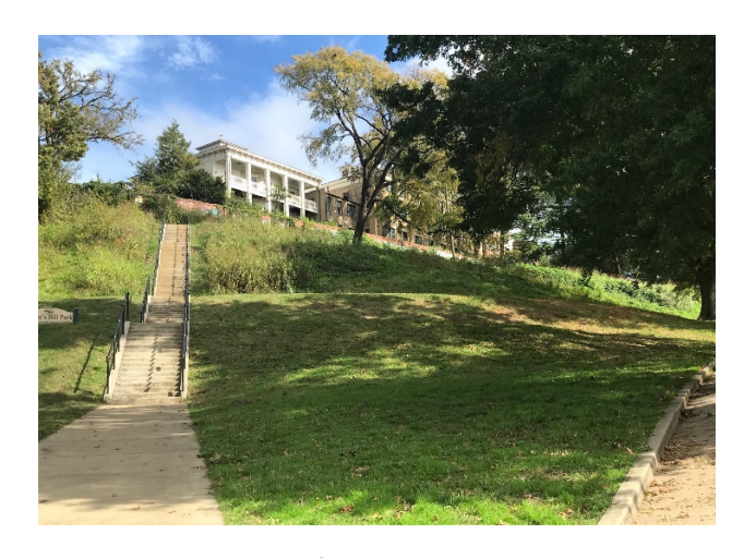
Figure 4. View from 22<sup>nd</sup> and E. Franklin Street