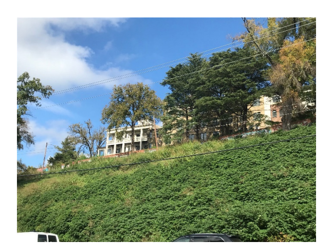
Figure 3. View from E. Franklin Street