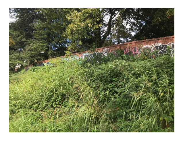
Figure 1. View from Taylor Hill Park