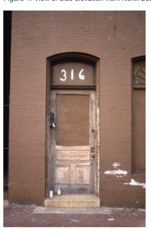
Figure 3. Front door, 1981