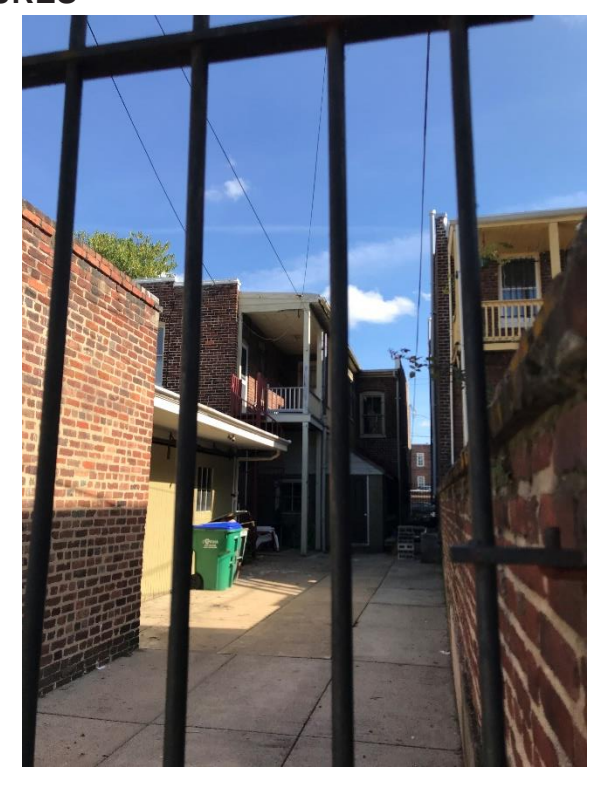
Figure 2. View of rear from alley.