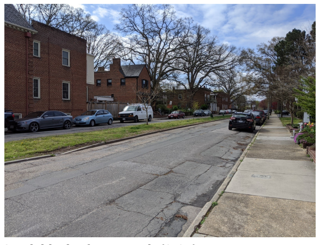
South block of Roseneath (3-24)