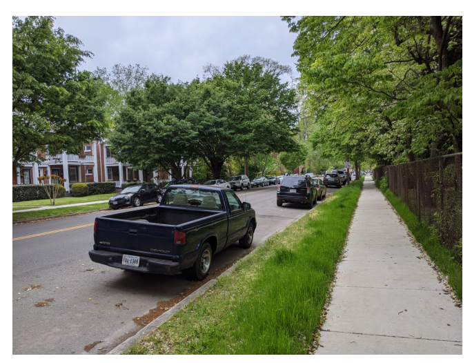
3400 block of Kensington (4-19)