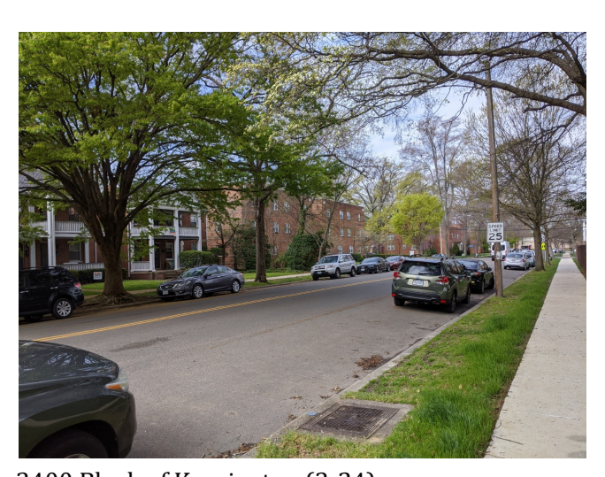
3400 Block of Kensington (3-24)