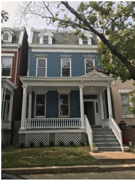
Figure 2. Painted facade of 2721 West Grace Street