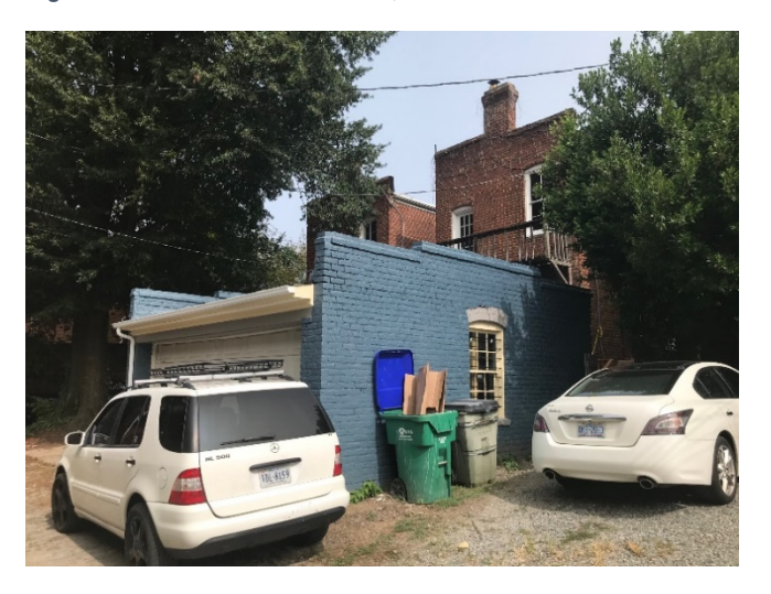
Figure 3. Painted garage at 2721 West Grace Street