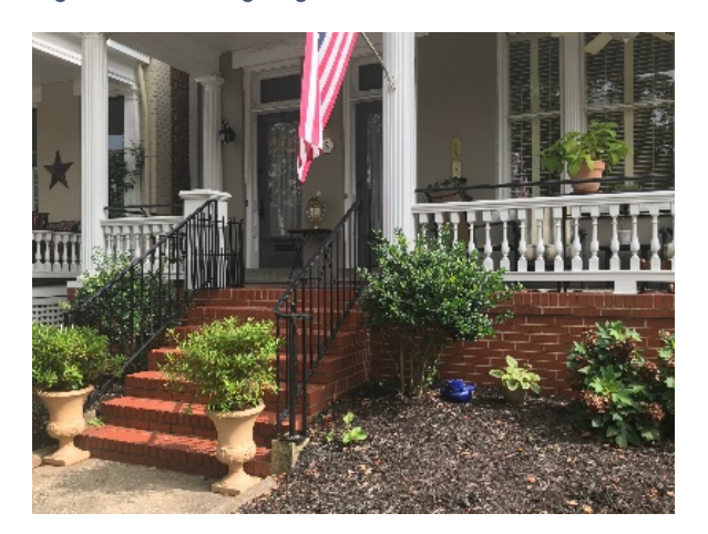
Figure 5. 2713 W Grace Street metal railing example