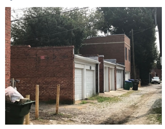
Figure 4. Red brick garages on the subject block