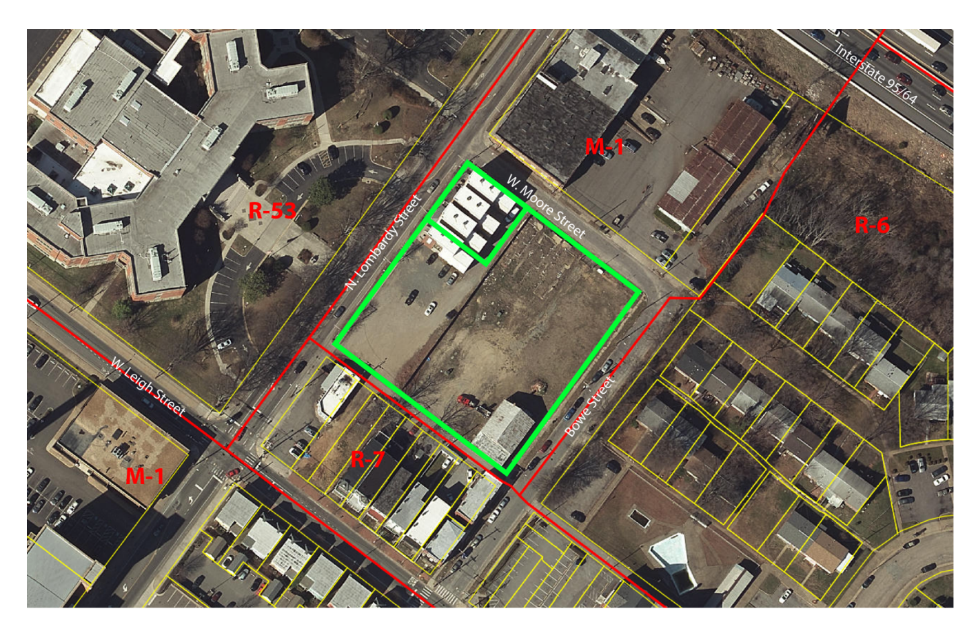
1027 and 1041 N. Lombardy Street (Figure 1)