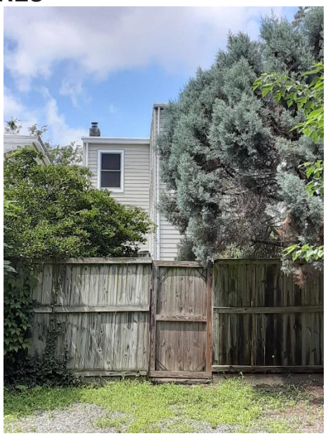
Figure 2. View of deck from the alley