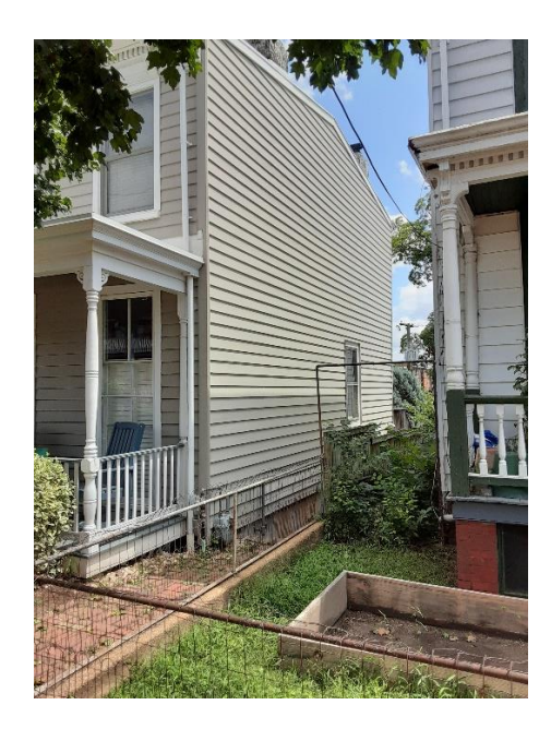
Figure 1. View of deck from North 28th Street

It is the assessment of staff that the application is consistent with the Standards for Rehabilitation and New Construction outlined in Section 30-930.7 (b) and (c) of the City Code, as well as with the Richmond Old and Historic Districts Handbook and Design Review Guidelines, specifically the pages cited above, adopted by the Commission for review of Certificates of Appropriateness under the same section of the code.