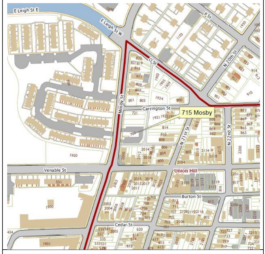
The City of Richmond assumes no liability either for any errors, omissions, or inaccuracies in the information provided regardless of the cause of such or for any decision made, action taken, or action not taken by the user in reliance upon any maps or information provided herein