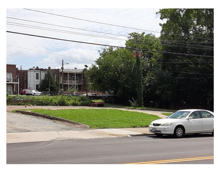
Figure 1. 715 Mosby Street, view from street