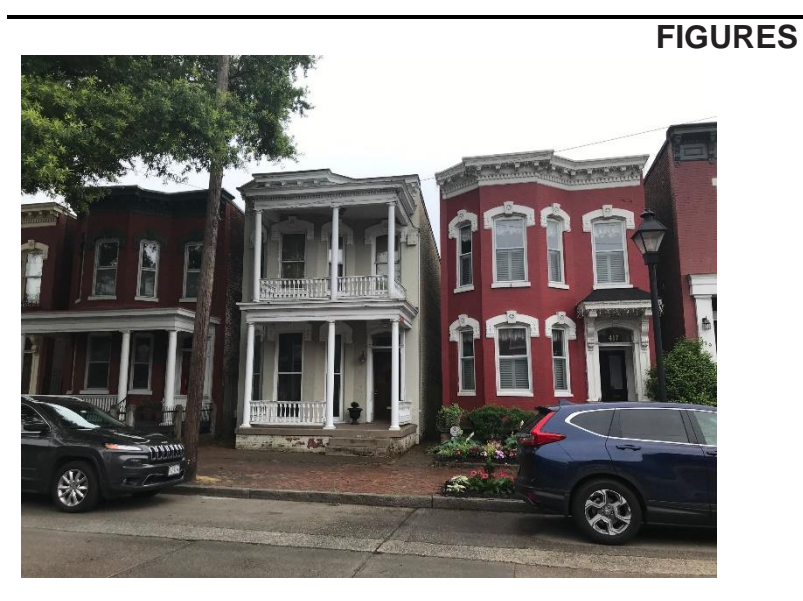
Figure 1. 415 West Clay Street, façade

It is the assessment of staff that, with the conditions above, the application is consistent with the Standards for Rehabilitation and New Construction outlined in Section 30-930.7 (b) and (c) of the City Code, as well as with the Richmond Old and Historic Districts Handbook and Design Review Guidelines, specifically the pages cited above, adopted by the Commission for review of Certificates of Appropriateness under the same section of the code.