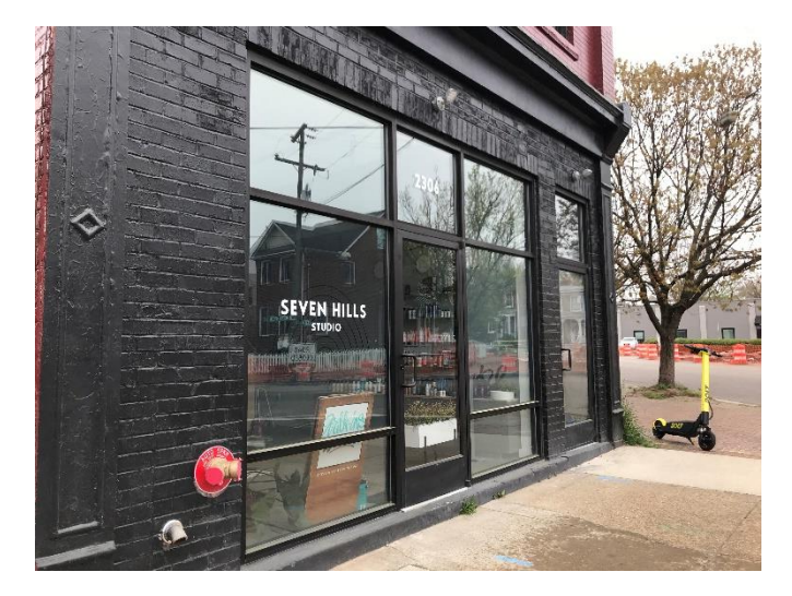
Figure 3. Storefront detail