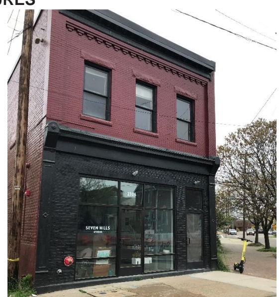
Figure 2. 2306 E. Leigh St, current conditions