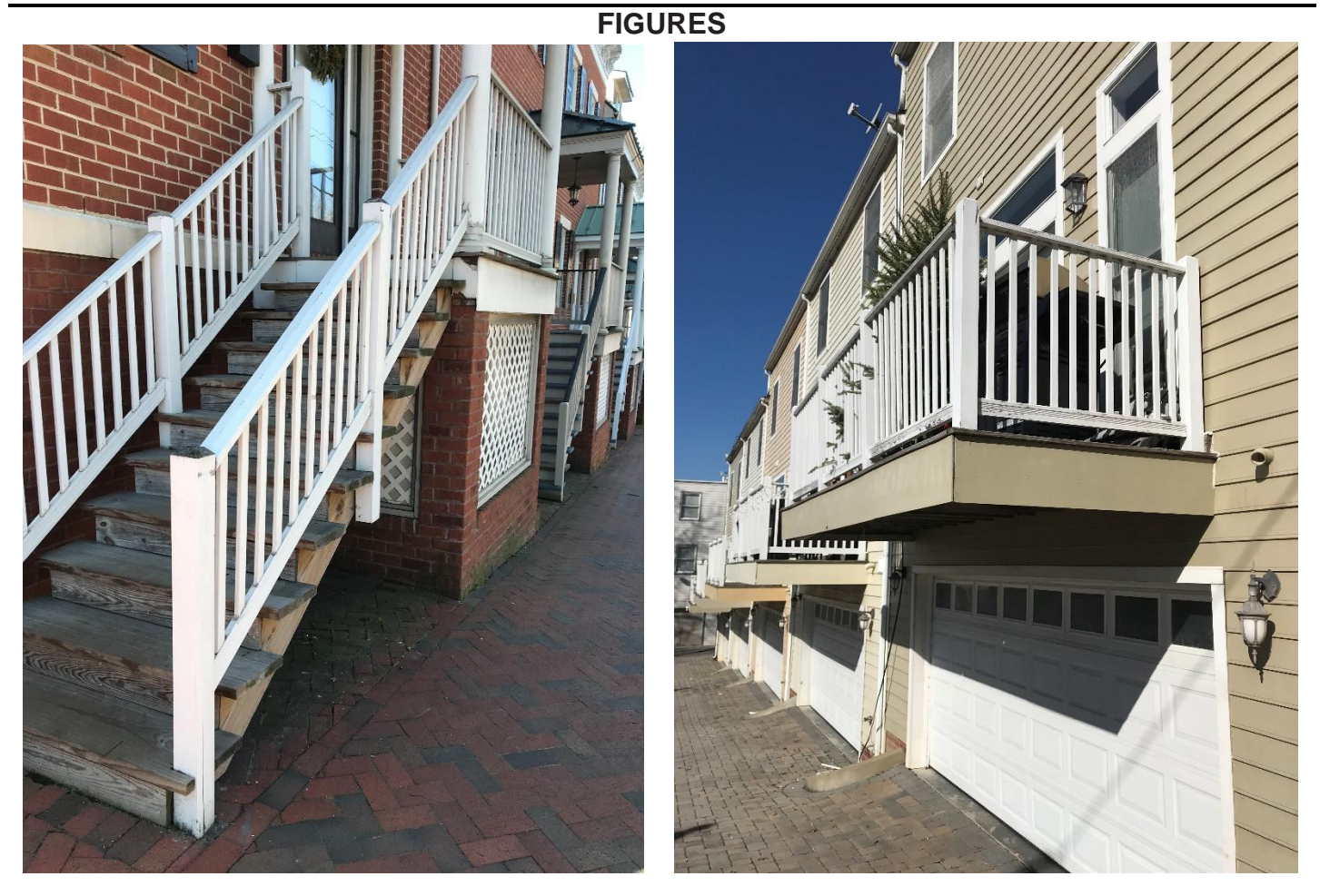
Figure 1. Front porch detail

It is the assessment of staff that the application is consistent with the Standards for Rehabilitation and New Construction outlined in Section 30-930.7 (b) and (c) of the City Code, as well as with the Richmond Old and Historic Districts Handbook and Design Review Guidelines, specifically the pages cited above, adopted by the Commission for review of Certificates of Appropriateness under the same section of the code.