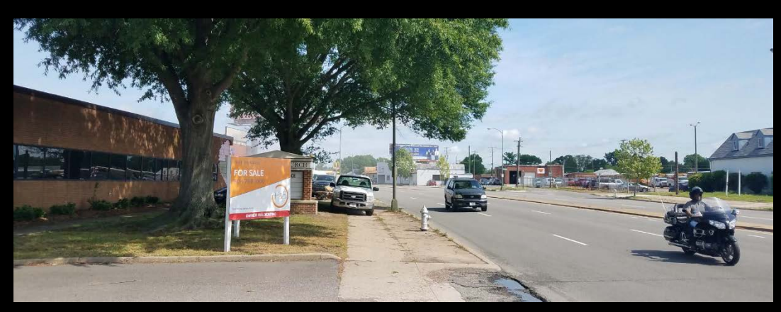
Chamberlayne Pkwy – Looking North