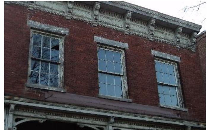
Figure 1. Front windows, November 2017, showing shutter hinges.