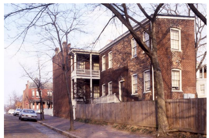
Figure 4. Side and rear elevations, 1985.