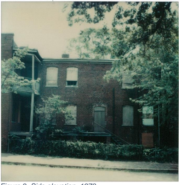
Figure 2. Side elevation, 1978.