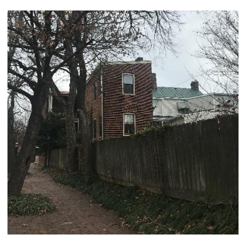
Figure 6. Existing rear elevation.