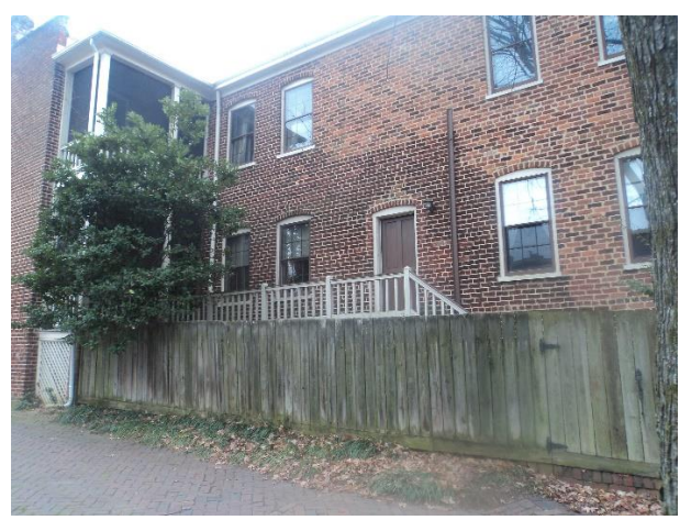
Figure 5. Existing side elevation.