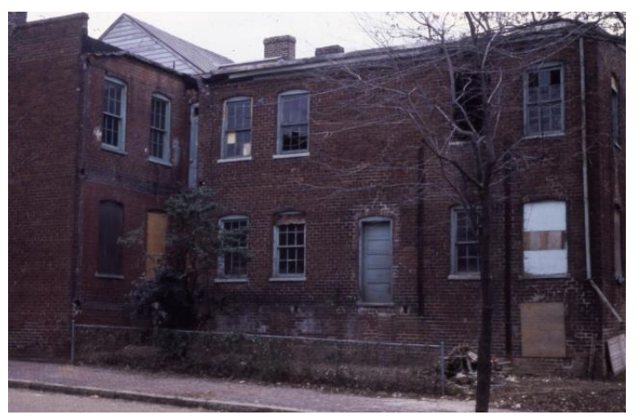
Figure 3. Side elevation, 1979.