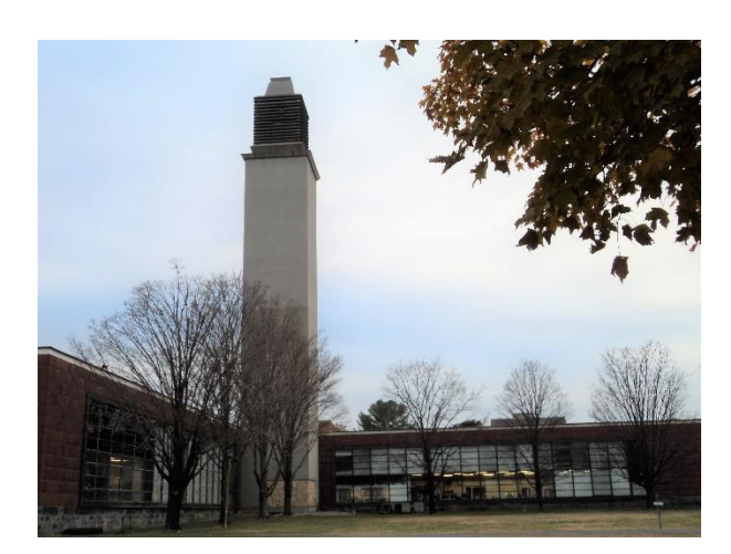
Figure 1. Belgian Building complex.