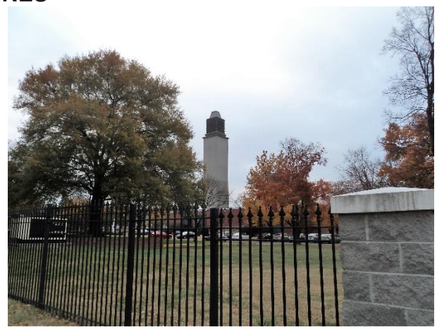
Figure 2. Belgian Building tower.