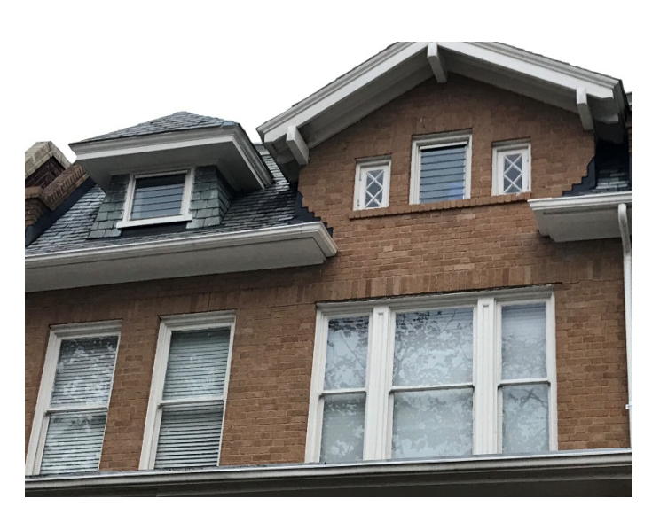
Figure 2. Windows, existing condition.