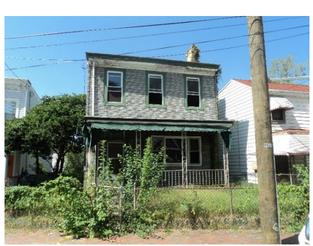
Figure 1. 706 North 21st Street, current conditions.