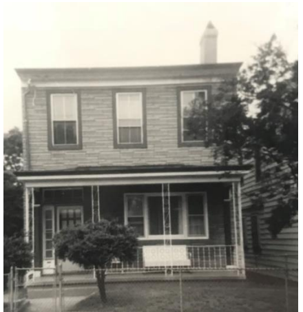
Figure 7. 706 North 21st Street, 1977.