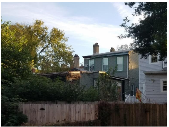
Figure 4. 706 North 21st Street, October 2018.