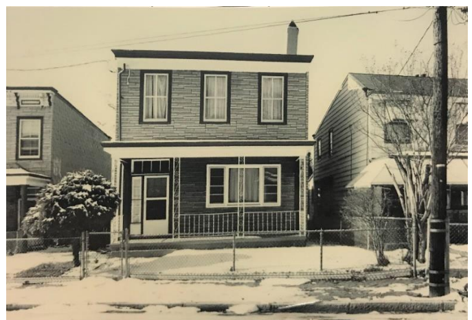
Figure 8. 706 North 21st Street, 1993.