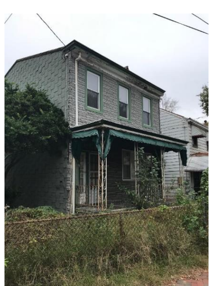
Figure 3. 706 North 21st Street, October 2018.