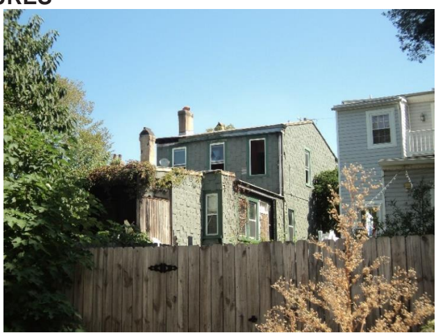
Figure 2. 706 North 21st Street, current conditions.