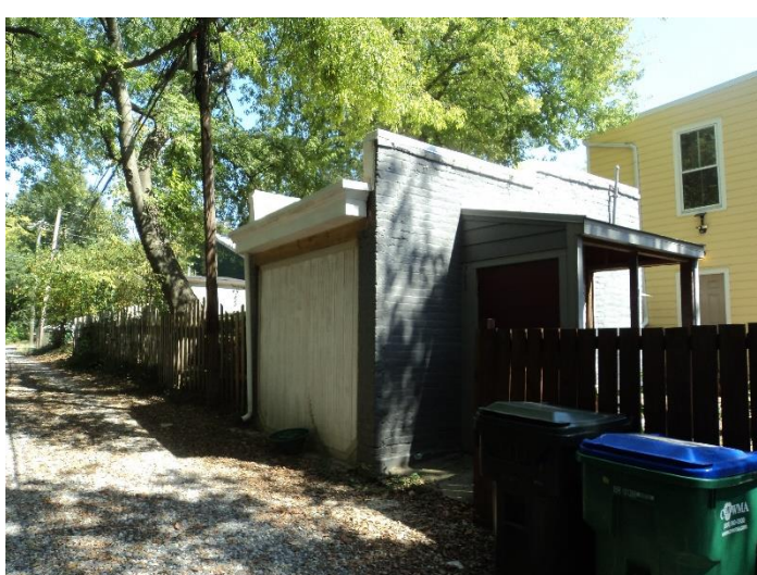
Figure 4. Nearby historic garage