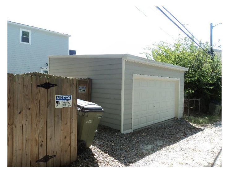
Figure 3. Nearby new construction garage