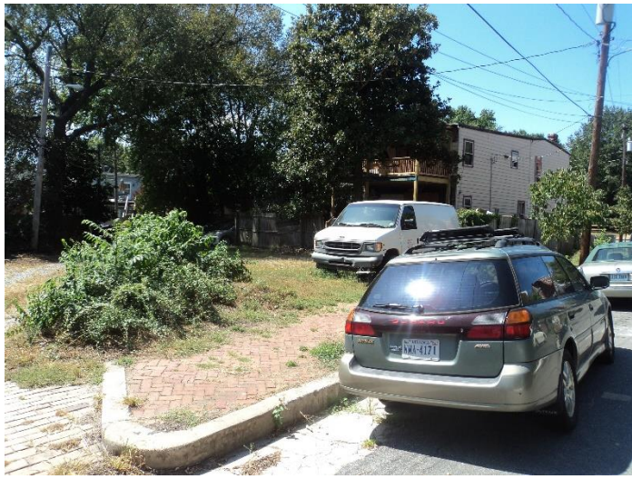
Figure 2. Rear of property from East Leigh Street