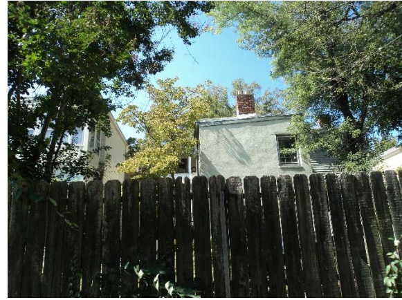
Figure 3. 105 N. 29th Street, view of side and rear porch from the rear alley.