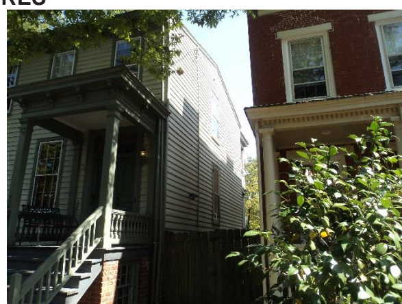
Figure 2. 105 N. 29th Street, view of side porch from the street.