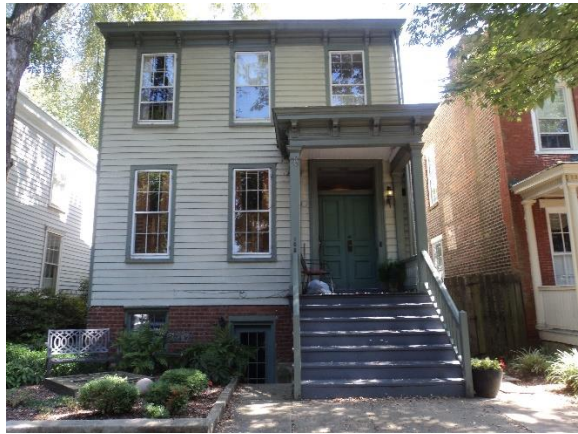
Figure 1. 105 N. 29th Street.