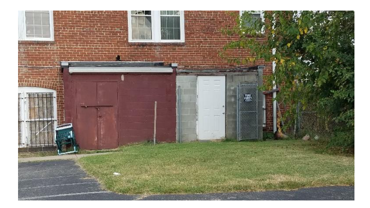
Figure 3. Existing sheds to be removed.