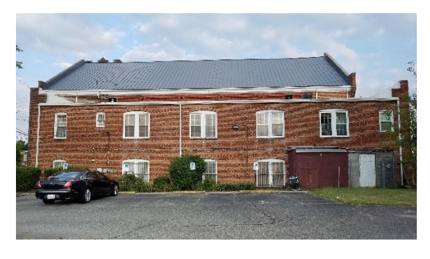
Figure 2. Sixth Mount Zion Baptist Church, east elevation.