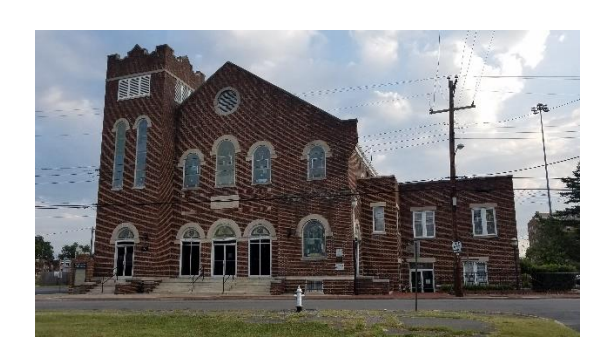
Figure 1. Sixth Mount Zion Baptist Church.