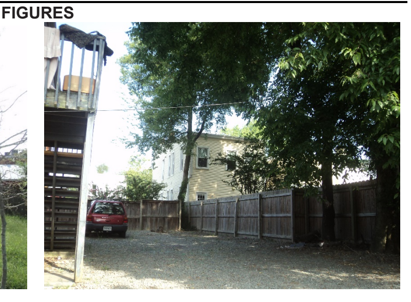
Figure 2. View of rear elevation from alley.