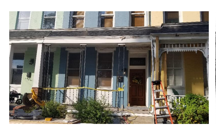
Figure 1. Front porch detail, July 2019