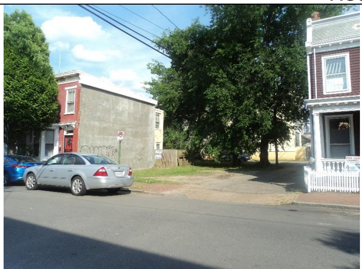
Figure 1. 519 St. James Street