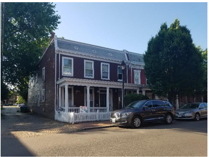
Figure 3. 500 block St. James St, odd side