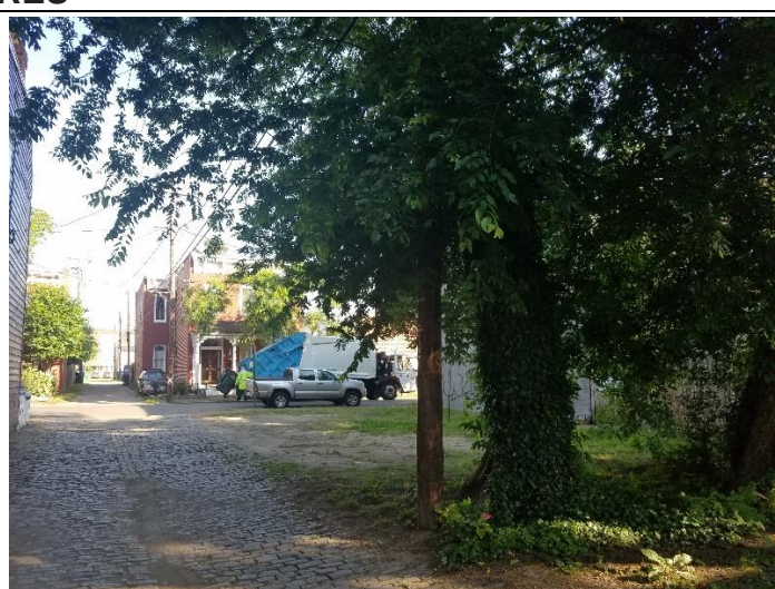
Figure 2. 519 St. James Street