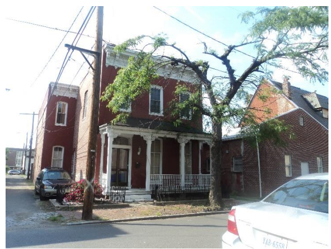
Figure 4. 500 block St. James St, even side